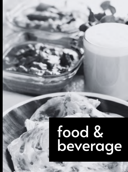
food & beverage