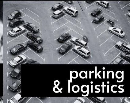
parking & logistics