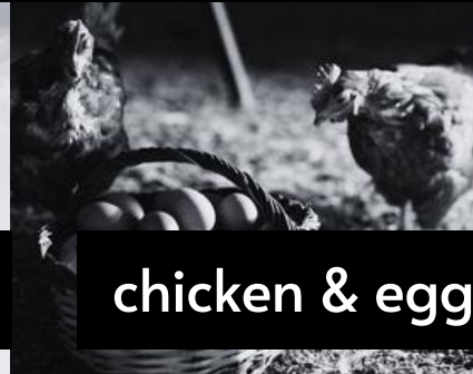
chicken & egg