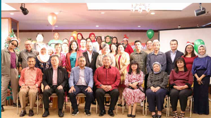
Greater AZAM Pre-Christmas & Year End Gathering