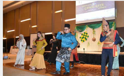
Greater AZAM Gawai-Raya Celebration