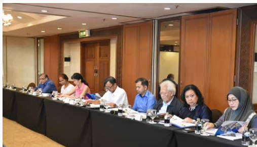
SDI's 22 nd Annual General Meeting 15 th September 2018, Pelagus Room, Grand Margherita Hotel, Kuching